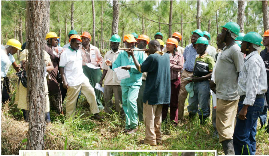
UTGA growers are trained on how to use a bitterlich stick to determine forest basal area.