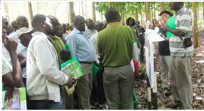
UTGA members in northern Uganda listen to CD, one of their own.