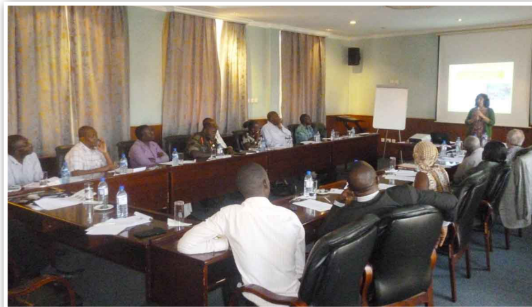
UTGA growers from the Mubende Cluster attend the organizational self-assessment seminar at City Royal Hotel, Bugolobi

UTGA organized a Breakfast Meeting for key Stakeholders at City Royal