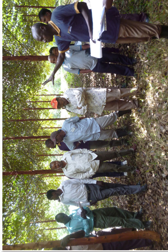
Training for UTGA Members in the Victoria Cluster on the growing of hybrid eucalyptus clones