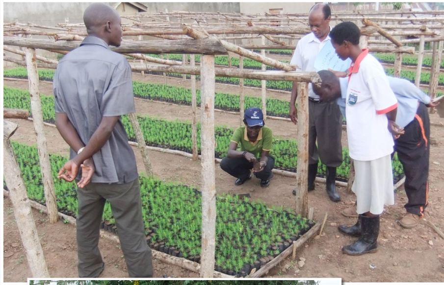
UTGA/SPGS team carrying out the Annual nursery certification in Western Uganda.