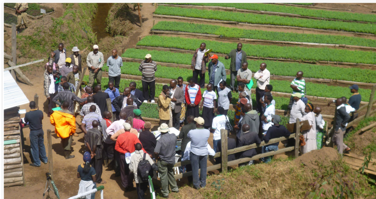
Modern nursery methods are critical for the production of good planting material