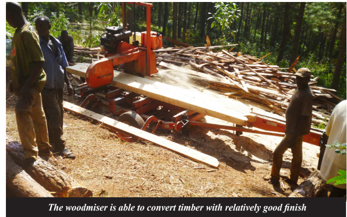
The woodmiser is able to convert timber with relatively good finish

As usual, we at UTGA always think it is important to get responses on issues that we have shared with the readers. Feedback on this annual report is almost as important as the report itself, because it will lead to possible reviews, amendments and improvements. While we continue to pledge our service to the Members, we also ask them to compliment these efforts by purchasing the services offered by the Association.