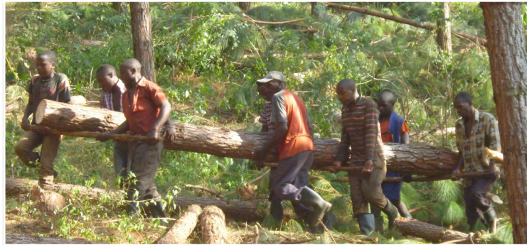
Manual extraction is tedious and inefficient. We have to find better modes of wood extraction from the forest

UTGA/NORSKOG joined SPGS on a field trip requested by the EU and Norwegian Ambassadors to Uganda. The excursion involved visiting plantations of two UTGA Members who have planted in the Mubende Cluster. The purpose of the field trip was to update the development partners on the increasing need to look into the future to preserve the high valued resources that were nearing maturity. Both Ambassadors were impressed by the state of the plantation development and promised to see how the sector could be supported in future.