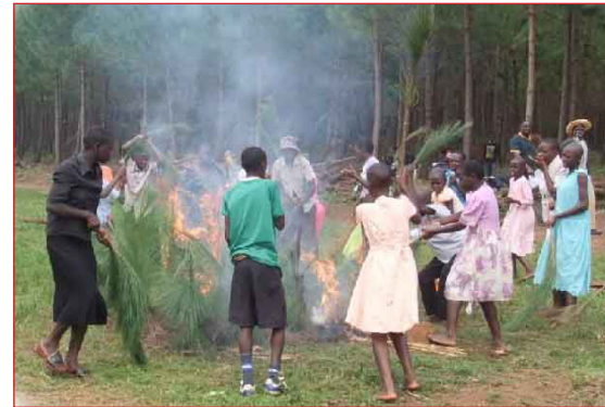
Pupils of Bukerenge P/S roleplaying at the Sensitisation Meeting on fighting forest fires at Core Woods in Bujaawe CFR in Hoima

Some Members suffered losses from the wildfires in their forests, especially in the dry season at the start of 2012. UTGA registered the loss of 942.5ha of plantations by fire amongst its Members. New Forests Company was the worst affected with a loss of more than 750 ha in the Namwasa plantation. UTGA therefore; embarked on a mass-media, sensitization drive against bush-burning and starting of intentional fires. Prevention of forest fires has become a theme at most of the Cluster meetings and all gatherings of UTGA Members.